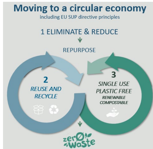
Graph 2: butterfly strategy deSter